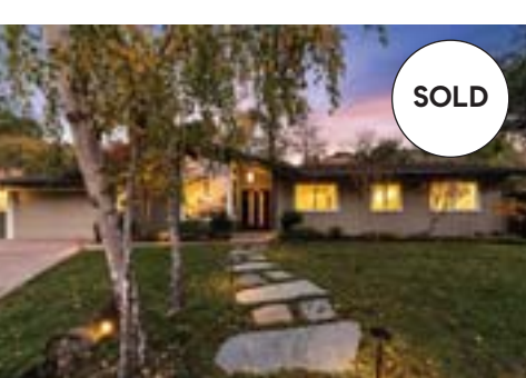
11 Rae Drive 9 Offers Represented Buyers