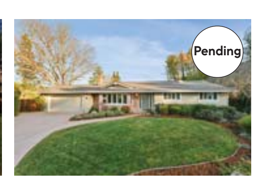
3155 Sandalwood Court 4 Offers Represented Buyers