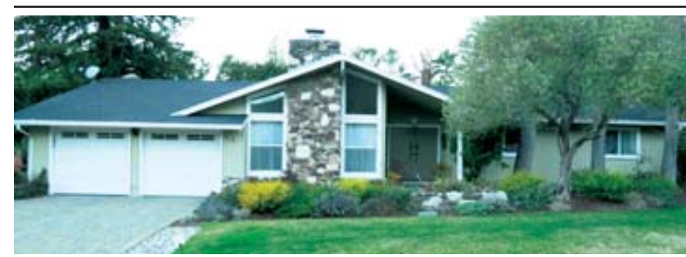
Just Sold Off-Market Call Keith For Details